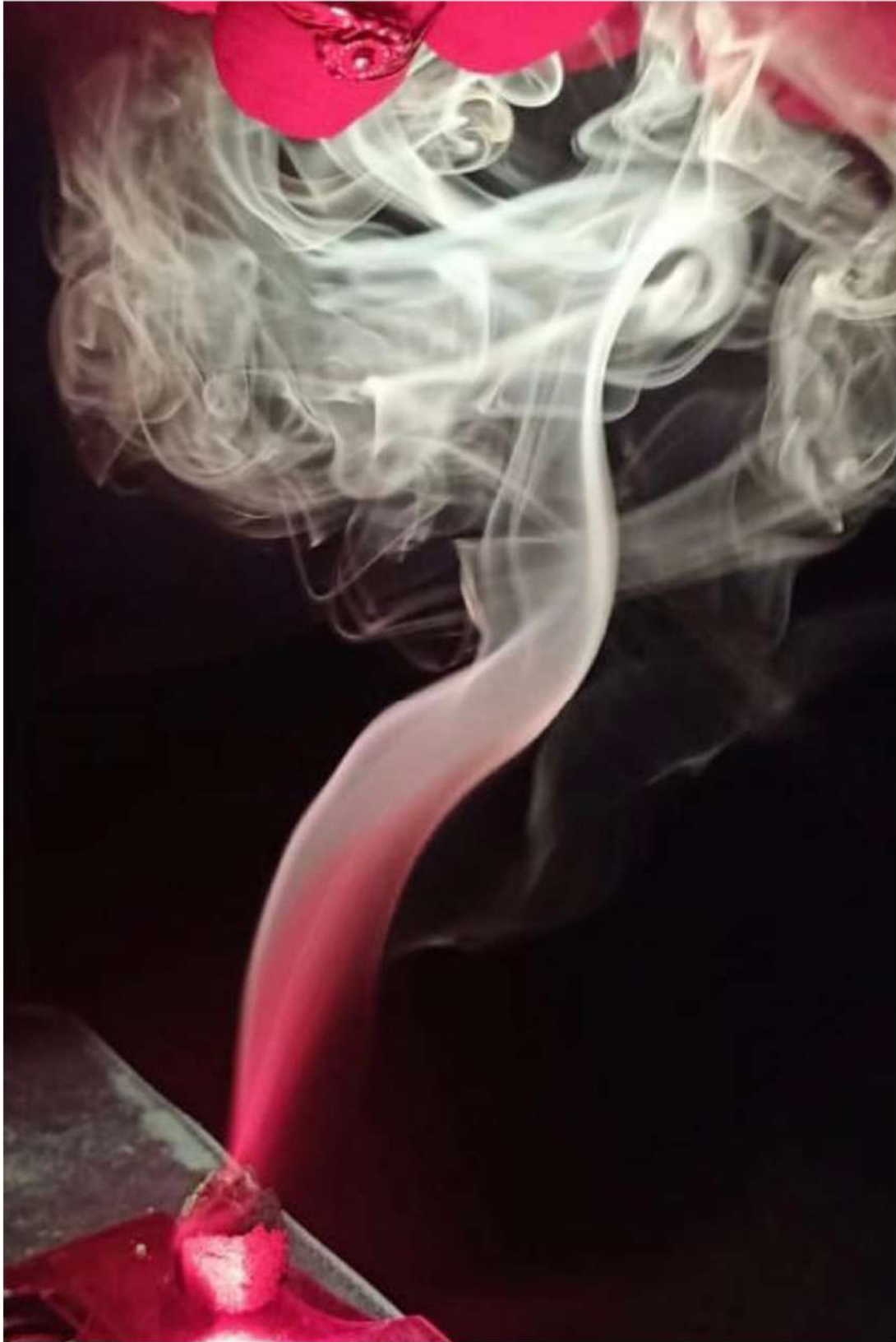
Students entry to the smoke art workshop/competition on 22-10-2022 @E110 - School of Architecture