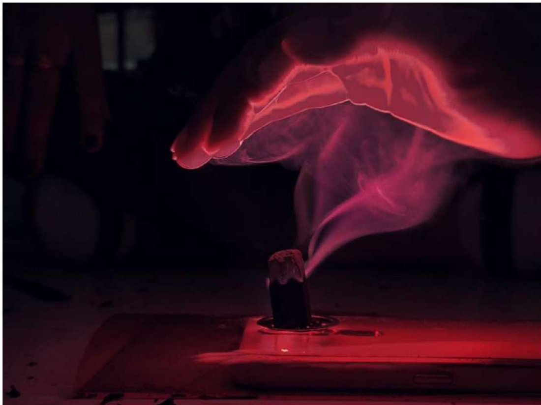
Smoke art illustration by the faculty and student incharges on 22-10-2022 @E110 - School of Architecture