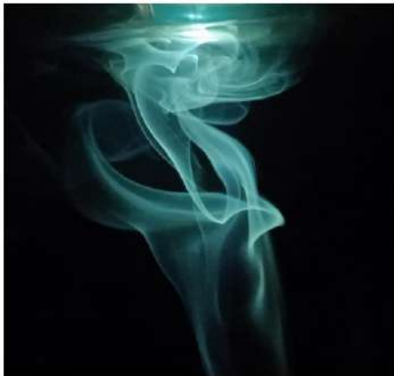
Students participating in the smoke art workshop/competition on 22-10-2022 @E110 - School of Architecture